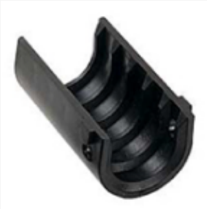
Tube adaptor from Ø 60 mm to Ø 48mm cod. 75260000