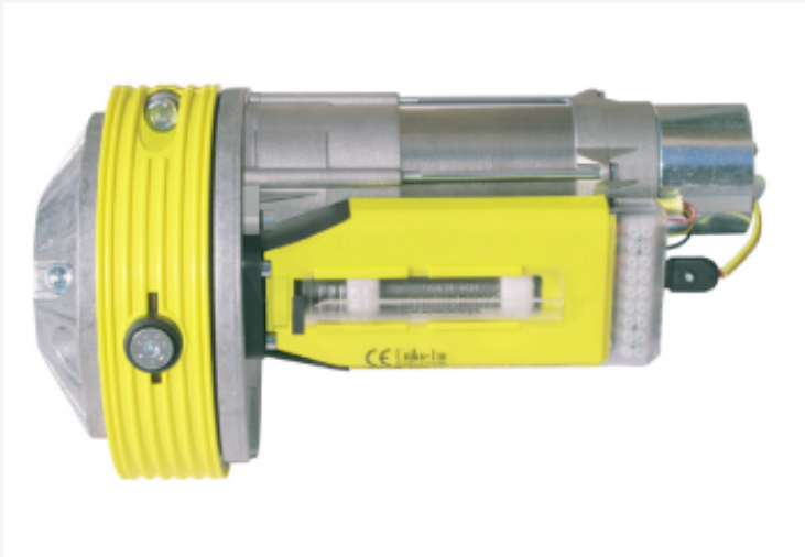
UNIKO - 1M EVOLUTION - cod. 72110000 Single-head central motor for rolling shutters