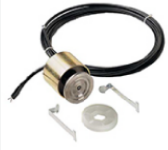
Electromagnetic brake Cable 4 meters cod. 75130000