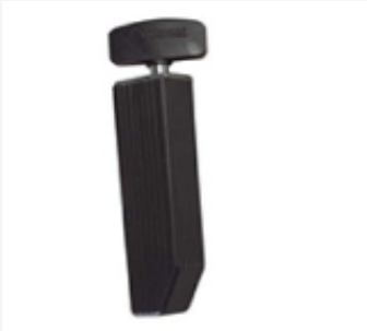
Brake release handle cod. 75160000