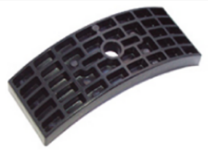
Kit flange adaptor Uniko from Ø 200mm to Ø 220mm cod. 75270000